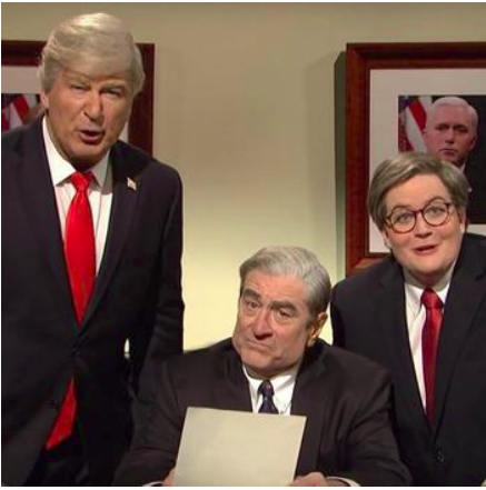
On 'S.N.L.' Trump, Mueller and Barr Interpret the Final Report Very Differently