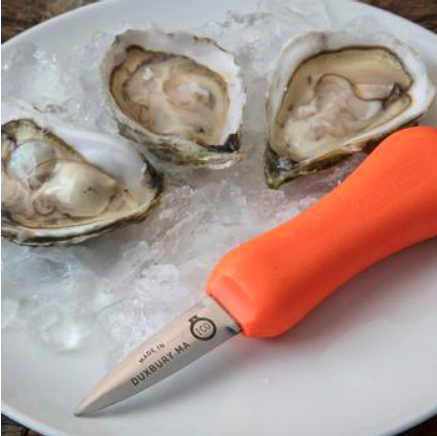
Can What We Eat Affect How We Feel?