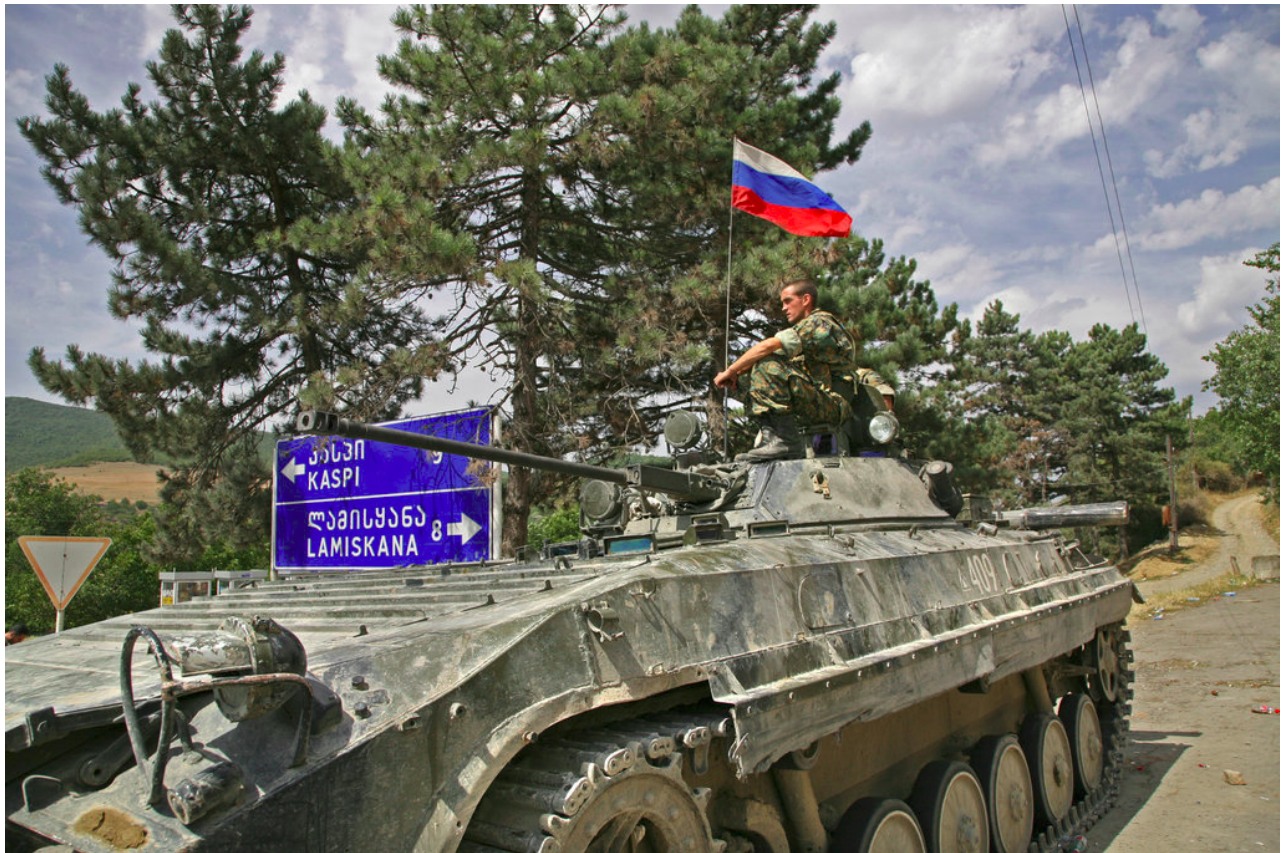
A Russian soldier sitting on a tank in the Georgian town of Igoeti in 2008.

One thing stands out vividly: the anti-aircraft guns firing round after round into the sky. I have a memory of a single Su-25 coming down in flames, floating like a leaf, back and forth, until it hit the ground.