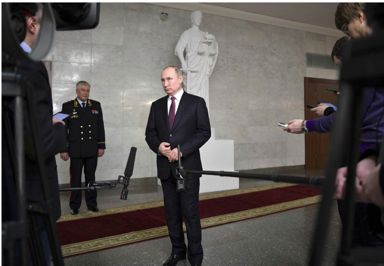
President Vladimir V. Putin has questioned the notion of Ukraine's independence from Russia.

Several years ago, while working in Moscow, I had gotten to know a handful of Russian intelligence officers. A retired colonel once listed the qualities that he, as a professional, believed a successful assassin should possess.