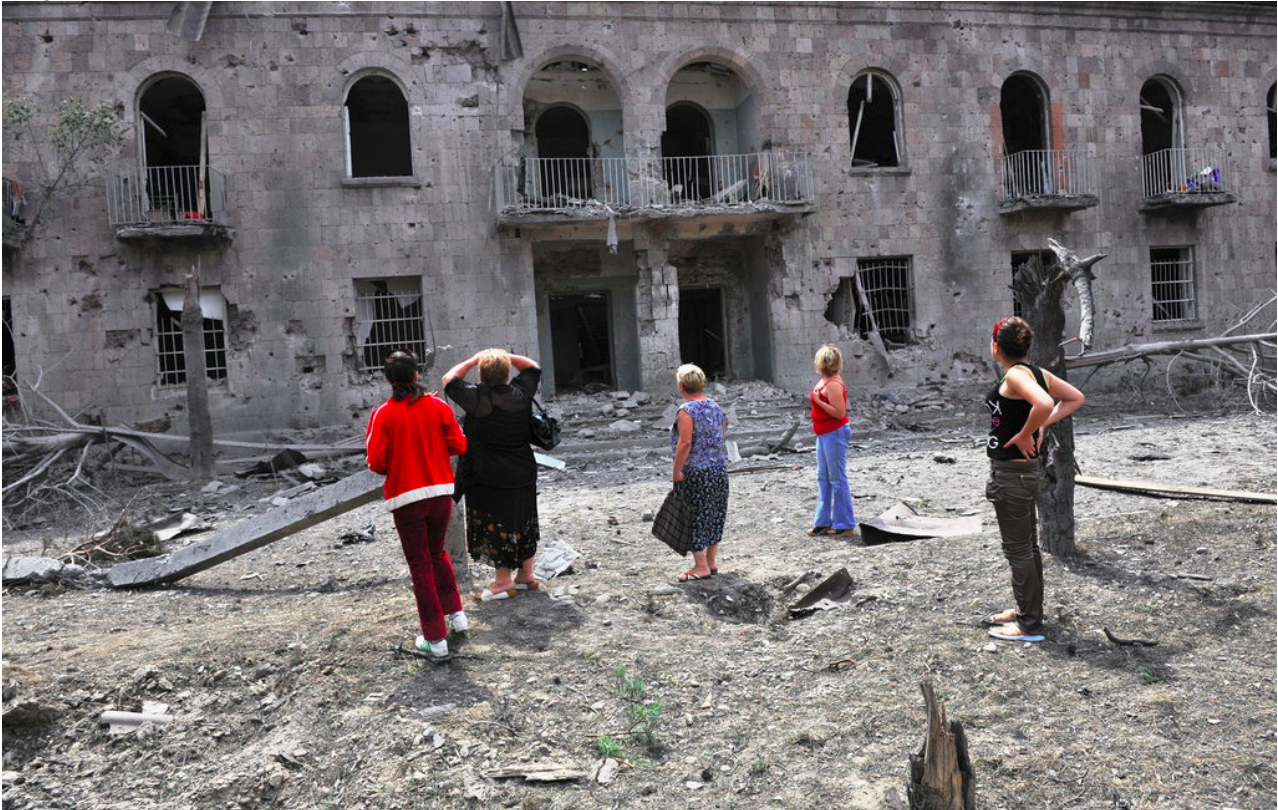
Georgians near a building hit by bombardments in Gori in 2008.